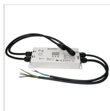
1789730 RGBW DMX enabler/decoder WP 4 channel (0.35A each CH)