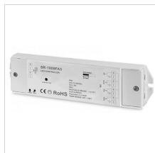
3104173 RGBW RF controller 4 channel (0.35A each CH)