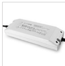
17096 Kit driver 48V WP