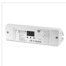
178973 RGBW DMX enabler/decoder 4 channel (0.35A each CH)