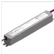
17433 Kit driver 48V